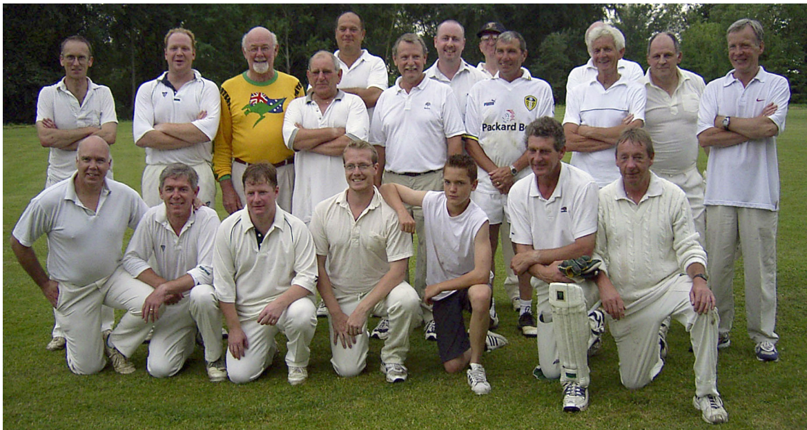
Kempsford C.C. The Old and the not so Old!